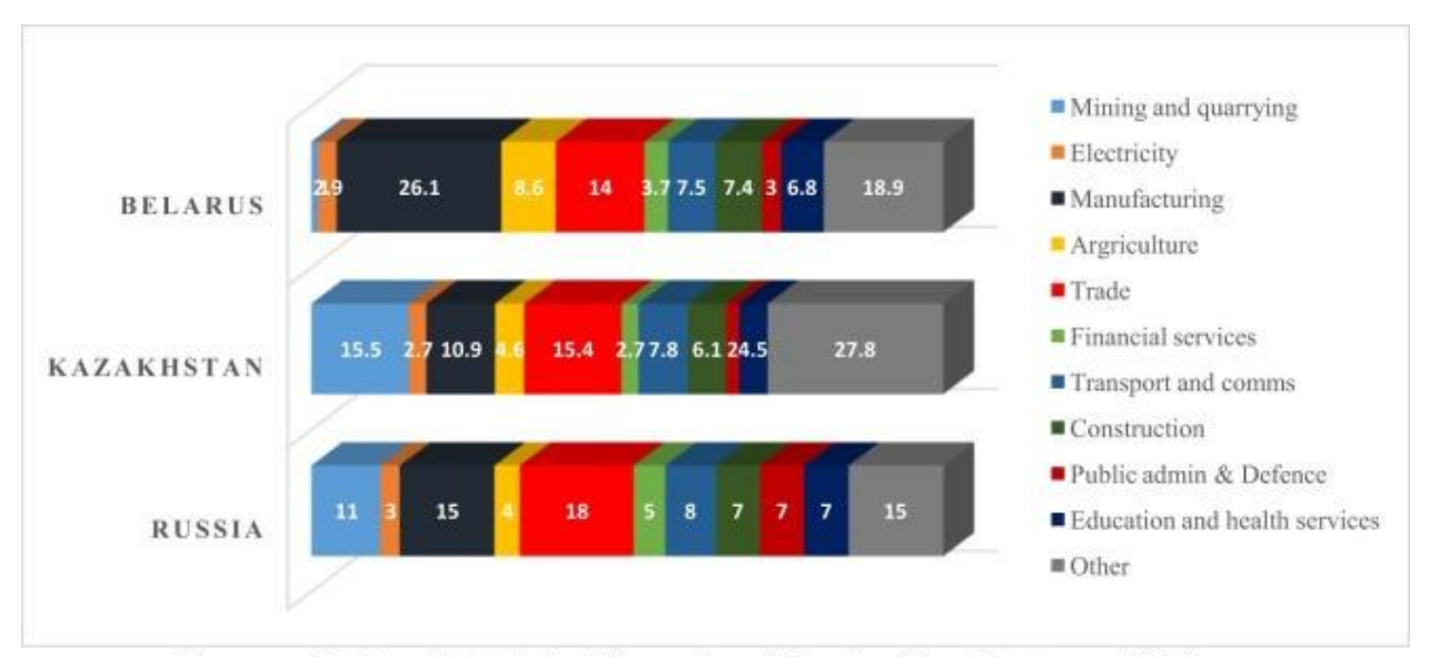
Sources: National Statistical Agencies of Russia, Kazakhstan and Belarus