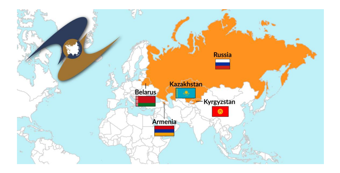
On January 1, 2018, the new Customs Code of the EAEU came into force. In Kazakhstan, explanatory and organizational preparatory work was carried out in a timely manner with the participation of representatives of state bodies and the business community. In particular, Kazakhstan sent 552 amendments (38% of all amendments), of which 65% of the amendments were adopted. The new Customs Code was synchronized with a number of laws of Kazakhstan: amendments were made to the Tax, Environmental Codes, the Code of Administrative Offenses, etc.