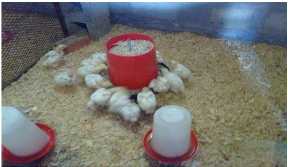
Figure 5: Experimental birds tasting experimental diet

A total of 180 day-old broilers were used in this study. The birds were randomly divided into 4 treatments of 45 birds each. Each treatment was replicated 3 times with 15 birds per replicate as shown in Figure 5 below. The experiment lasted for six weeks. The birds were reared in deep litter system. Fresh water and treatment diets were supplied ad libitum throughout the period of the experiment. Routine management practices including vaccination and drug administration when necessary was duly observed.