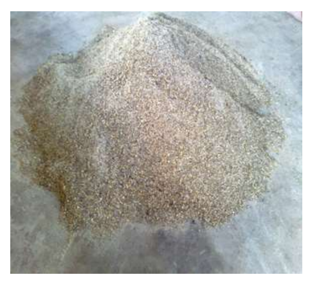
Figure 4: Experimental diet in the mash form

The physical and chemical composition of experimental diets used during the growing phase are shown in Table 3 below.