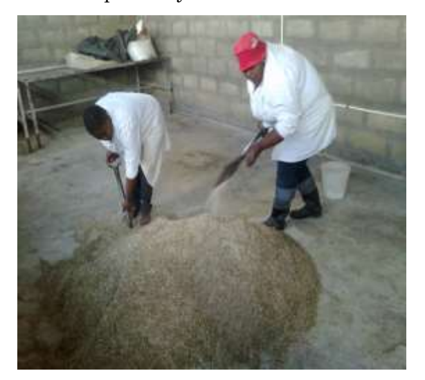
Figure 3: Mixing of experimental diets

Experimental diets were mixed and offered in a mash form as shown below in Figure 3 and 4 respectively.