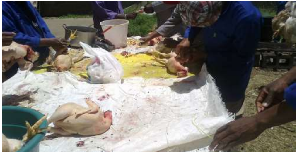
Figure 6: Slaughtering and eviceration of birds

At the end of growing and finishing phases (weeks 28 and 42) five birds from each replicate/15 birds per the treatment were fasted overnight, weighed and slaughtered by serving both of the right and left carotid artery and jugular vein in a single cut and allowed to bled. The carcasses were allowed to bleed freely for 5 minutes, defeathered using warm water and then re-weighed to obtain plucked carcass weight as shown in Figure 6 below. They were then be decapitated, eviscerated and weighed to obtain the dressed weights.