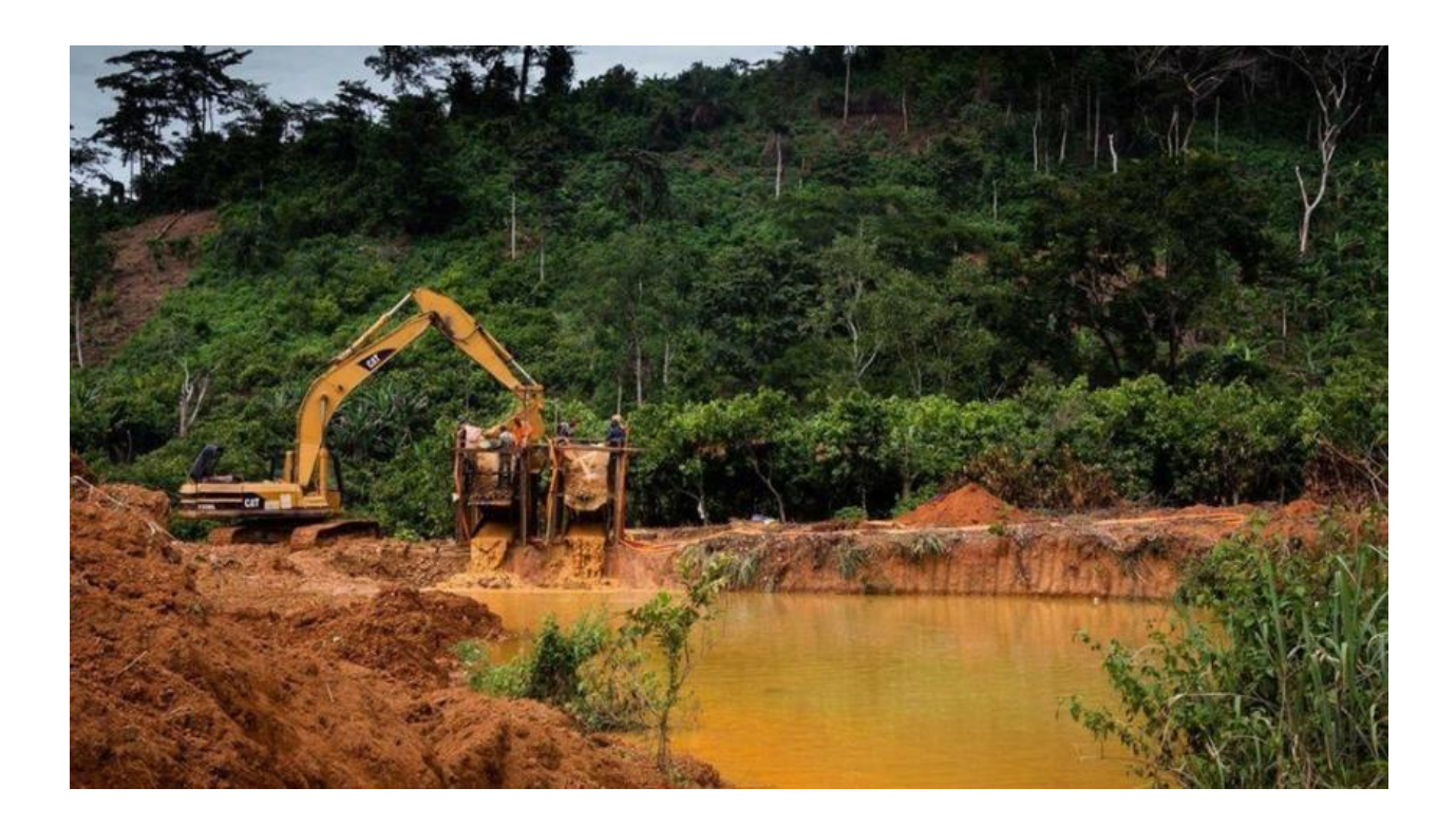
Fig 2 : Galamsey in Ghana threatens the water supply.