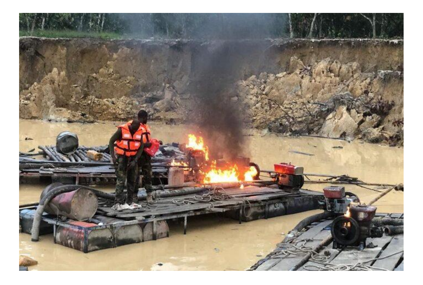
Fig 9: Illegal mining site on River Offin being cleared by personnel of Operation Halt II

Fig 8: Some of the mining equipment set ablaze.