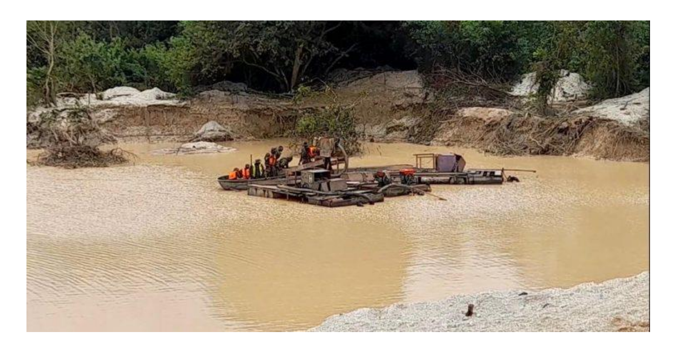
Fig 10: The Lands and Natural Resources Ministry has destroyed about 800 changfans used by illegal small-scale miners on River Offin and Pra.

Several equipment used for illegal mining activities on river Offin were destroyed and confiscated by security personnel as part of exercises to clamp down on illegal mining activities in the river and adjoining streams.