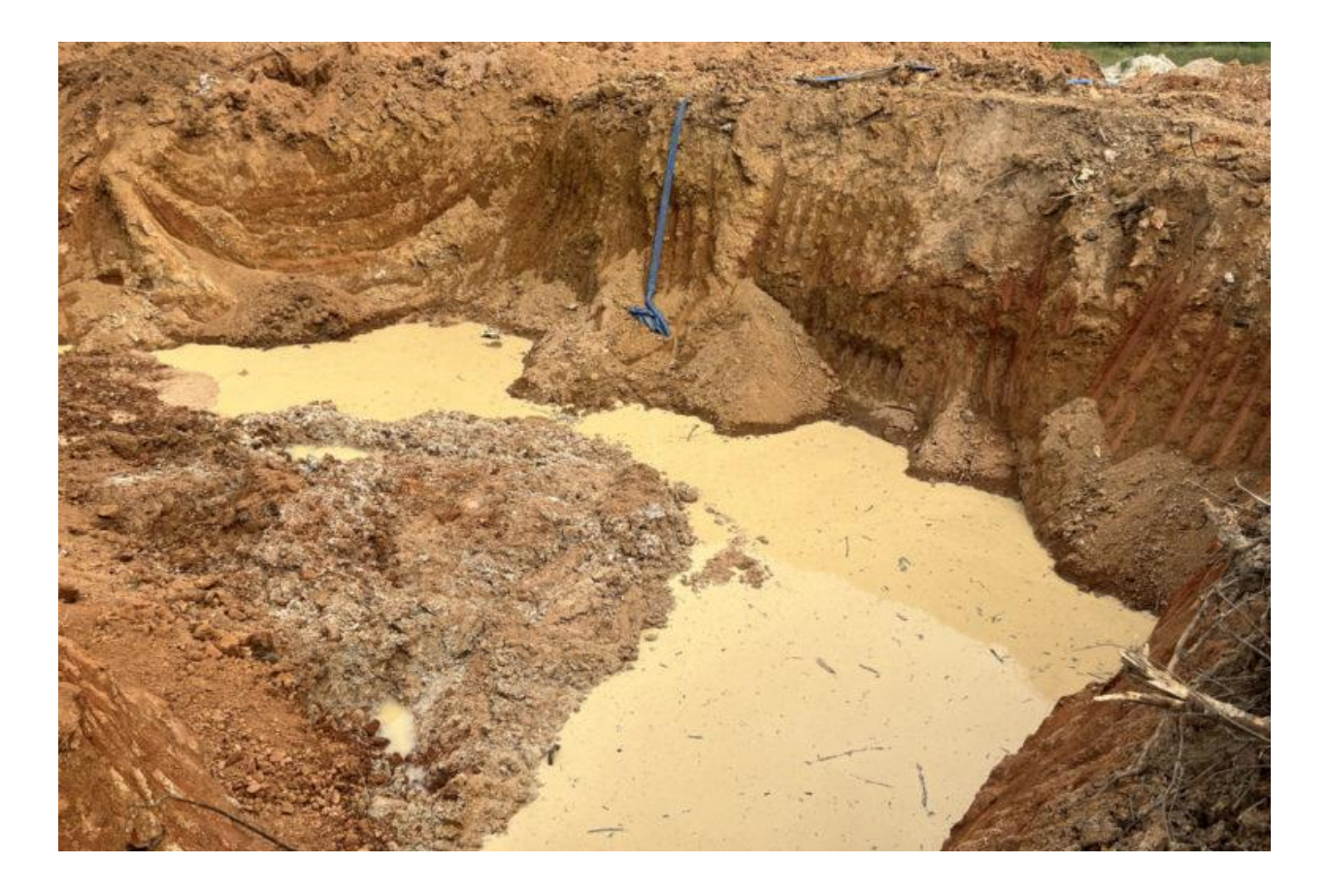
Fig 7: Water body turned muddy and toxic by illegal miners and affecting communities livelihood.

In conclusion, illegal mining undermines the livelihoods of local communities by displacing them from their lands and disrupting agricultural activities. The erosion of community livelihoods leads to reduced food security, increased poverty, and heightened social tensions. These challenges hinder overall economic development and perpetuate socio-economic inequalities within affected communities.