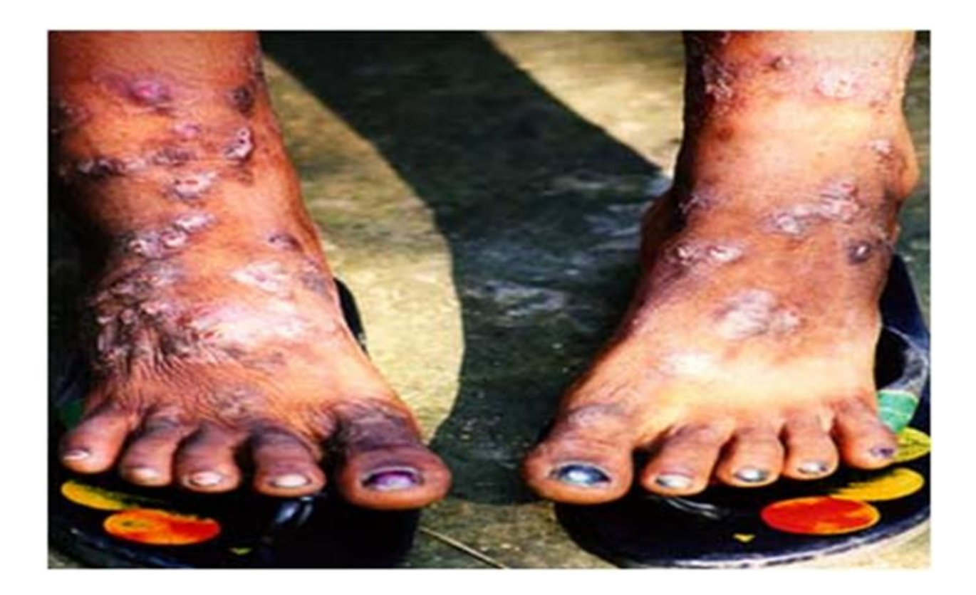
Fig 4: Skin roseola resulting from arsenic intake/ingestion.

In conclusion, illegal mining activities in Ghana pose significant health and safety risks for miners. The absence of proper safety measures, protective equipment, and training increases the vulnerability of miners to accidents, occupational diseases, and long-term health consequences. Addressing these risks requires strengthening regulations, promoting compliance with safety standards, and providing education and resources to miners. By prioritizing the health and safety of miners, the negative impacts associated with illegal mining can be mitigated, protecting the well-being of individuals and reducing the burden on the healthcare system.