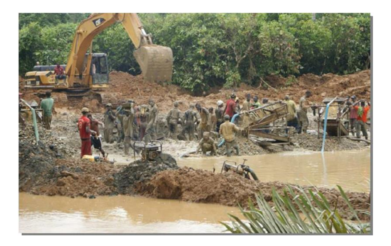
Fig 5: Loss of livelihoods of farmers in communities. Destruction of cocoa plantations and arable land degradation invaded by illegal small-scale miners

livelihoods leads to increased poverty, unemployment, and social instability, hindering overall economic growth and development. To address this issue, it is crucial to implement regulatory measures that protect the rights and livelihoods of communities while promoting sustainable mining practices.