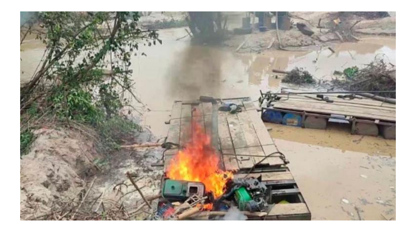
Fig 8: Some of the mining equipment set ablaze.