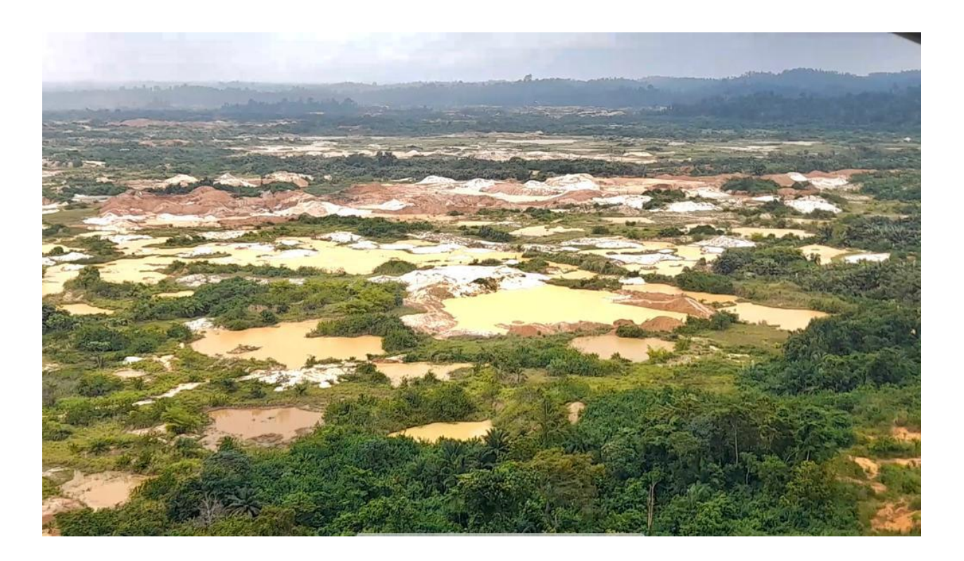
Fig 11 : Natural habitat being destroyed completely by illegal small scale miners at Bibiani

disrupt ecosystems, diminish biodiversity, and negatively affect sectors reliant on a healthy environment. Addressing environmental degradation through responsible mining practices is crucial for promoting sustainable economic growth and preserving natural resources for future generations.