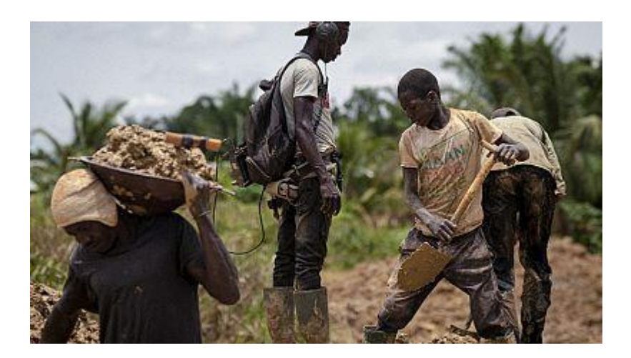
Fig 12: A group of Galamseyers destroying agriculture land.

yields, undermining food security and economic performance in the agricultural sector. Sustainable land management practices and responsible mining approaches are essential for mitigating the impact of illegal mining on agriculture and promoting long-term agricultural productivity and food security.